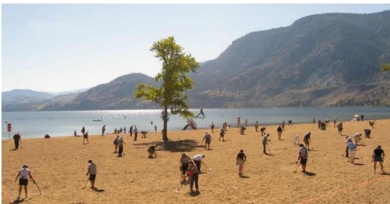
Treasures in the Sand, Skaha Lake