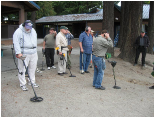
Getting ready for the start of the hunt...

Sorry so late with the newsletter, got a little behind working with the new dogs in our life. We are getting into a routine now and they seem to be doing well.