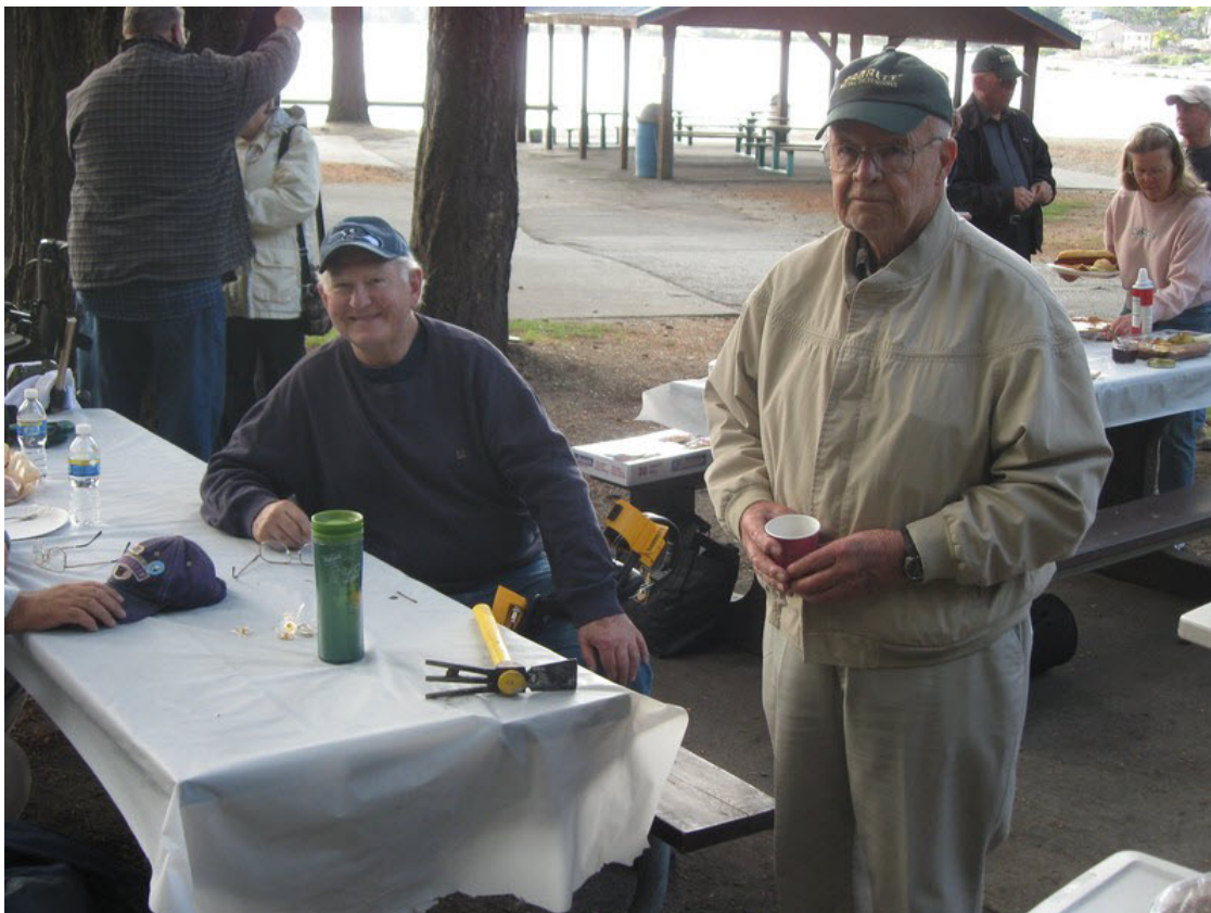
Thanks to all for bringing all that good food....