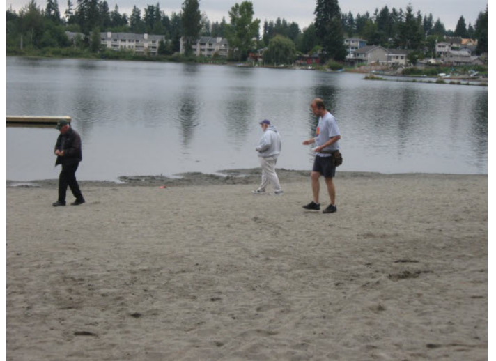
Enjoying nice morning hunt at Silver Lake